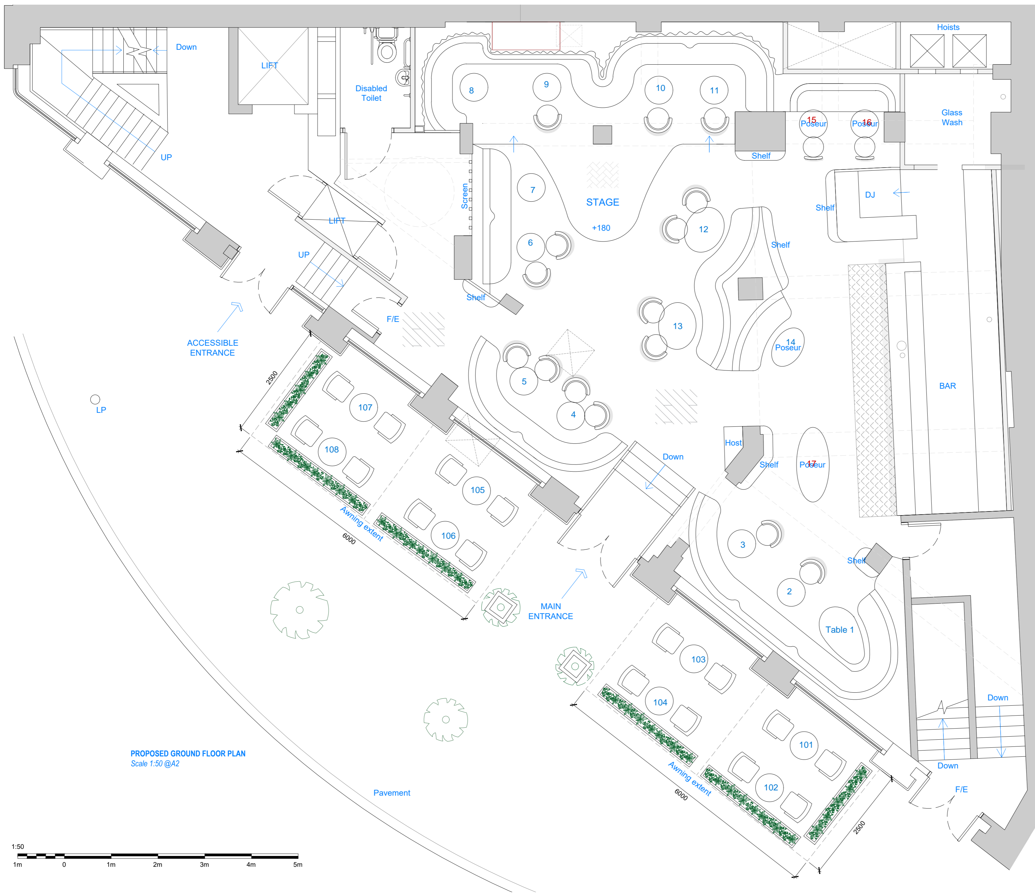
PROPOSED GROUND FLOOR PLAN Scale 1:50 @A2