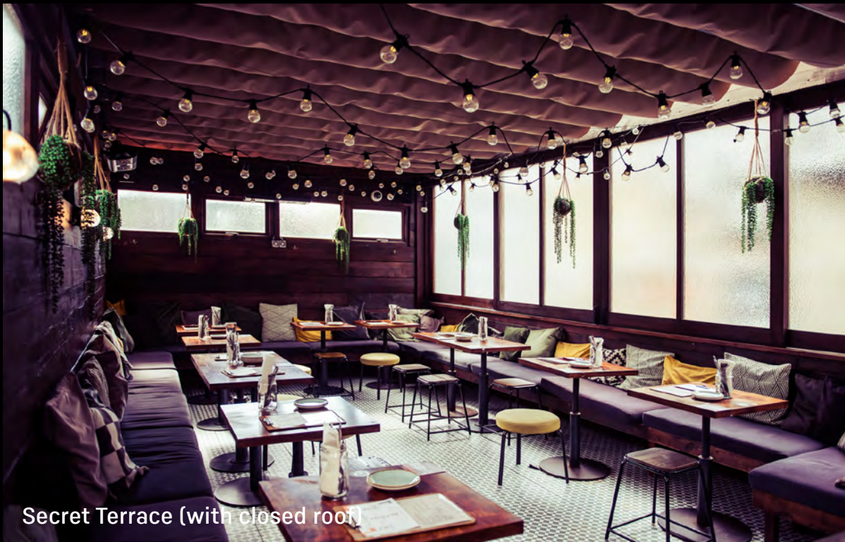
Secret Terrace (with closed roof)