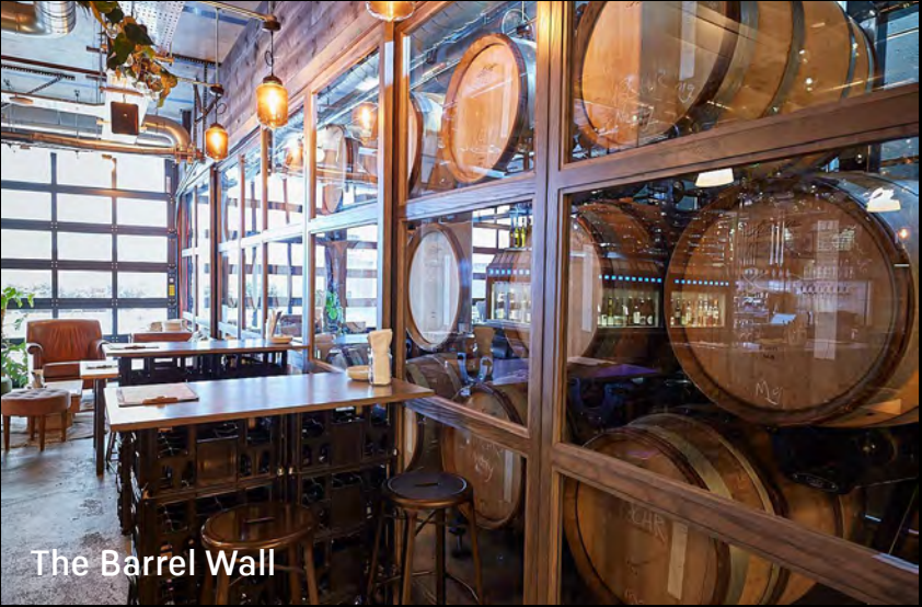
The Barrel Wall