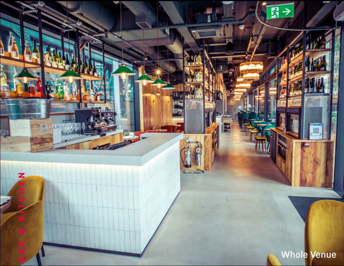
BAR & KITCHEN